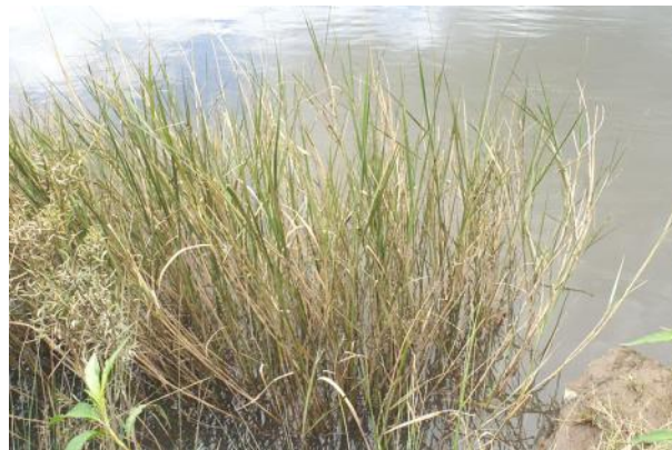
Hastings River Reed with root zone submerged