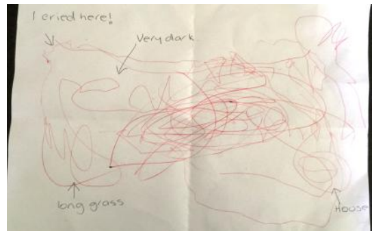
Kobi's version of what happened